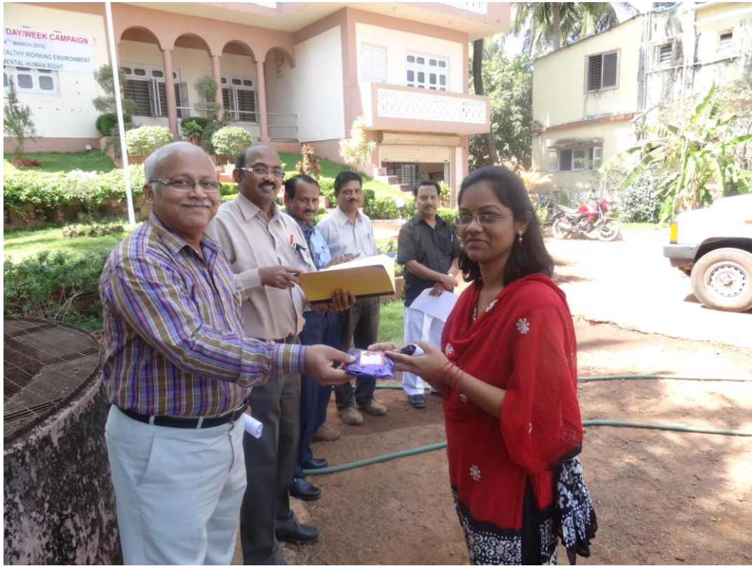
Prize being distributed to winner of Safety competition.