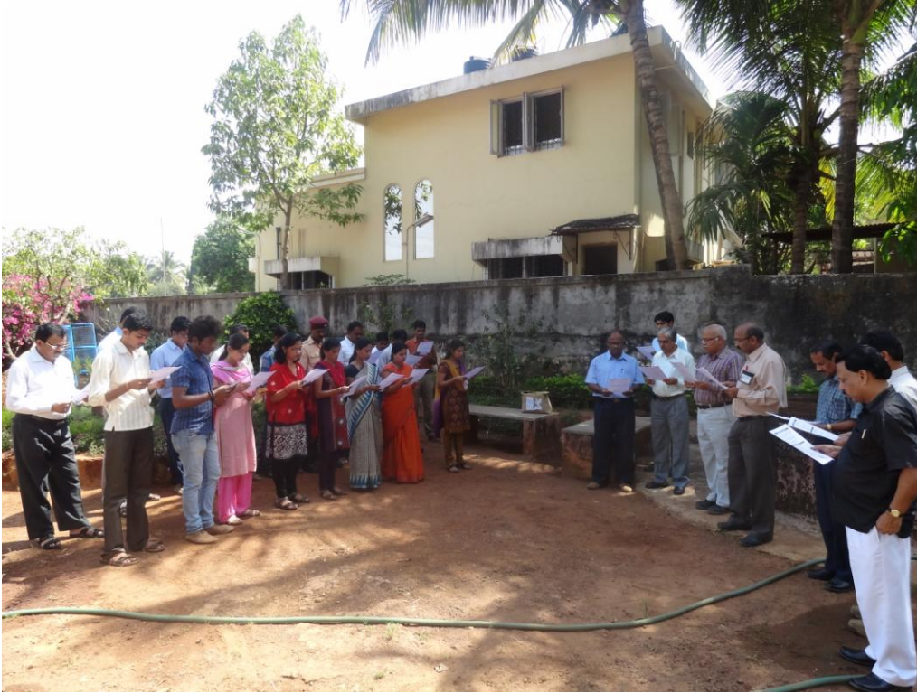
CMD's message being read.