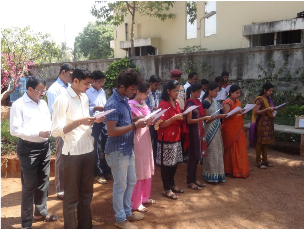
JNPP staff taking Safety and Health pledge.