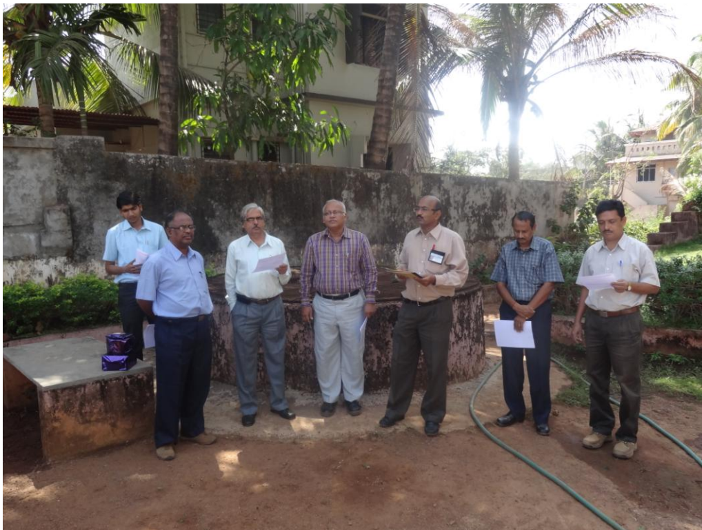
Head, Industrial Safety and Fire, JNPP explaining about importance of National safety day.