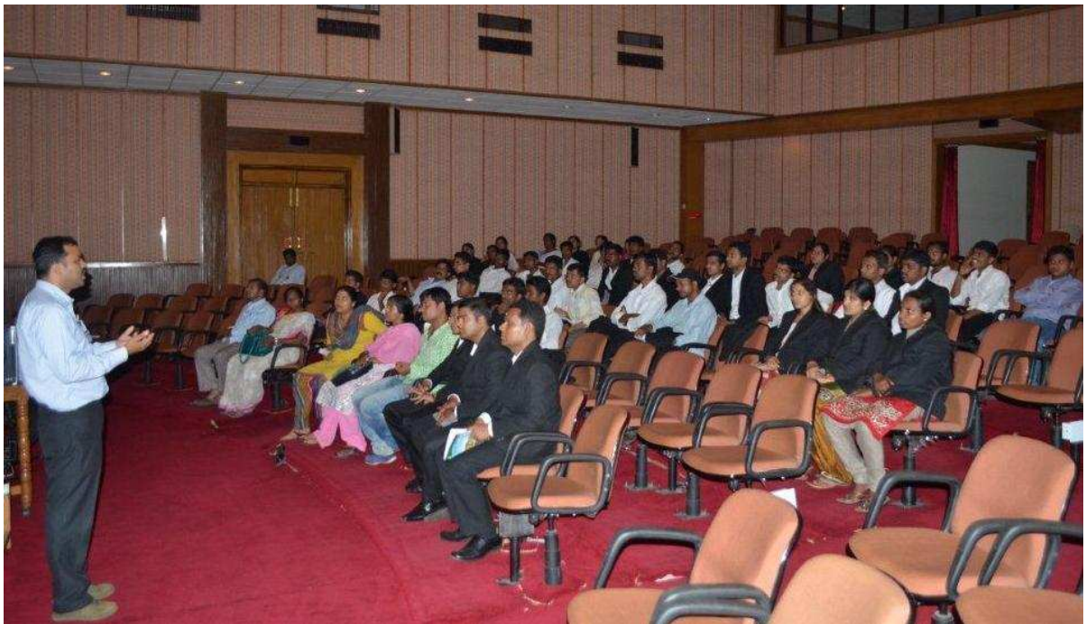
Visit of students & staff of J.S.S.Sakri Law College, Hubballi