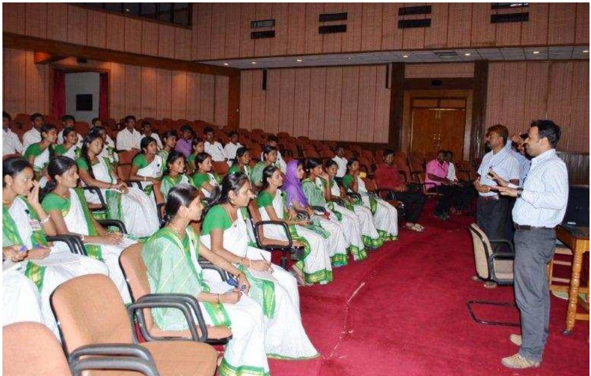
Visit of students & staff members of Bhartesh College of Education, Belgavi