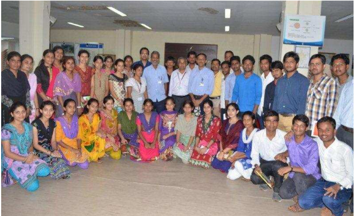
Visit of students & staff of Karnatak University, Dharwad