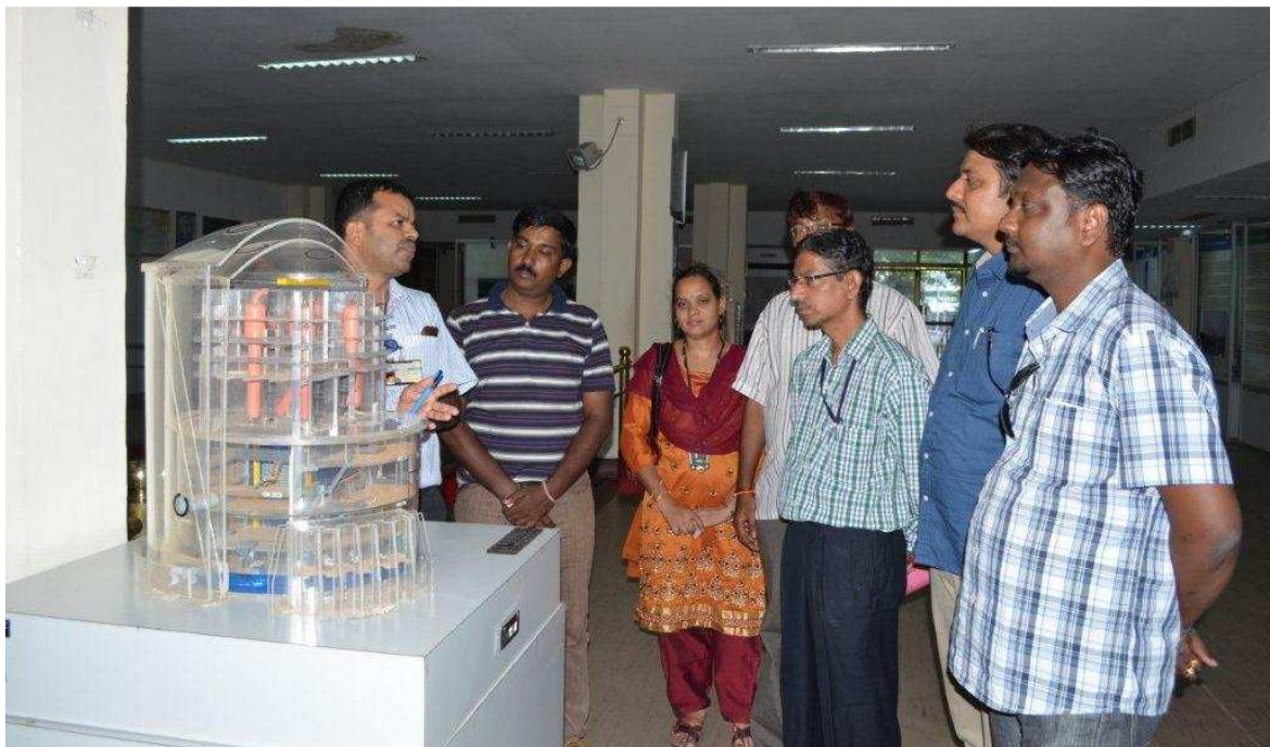
Officers & Staff members from HESCOM, Hubballi