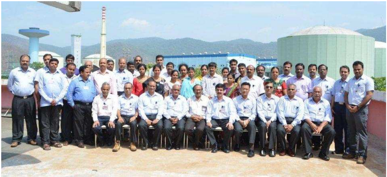
Officers & Staff members from Rare Materials Project, Mysuru