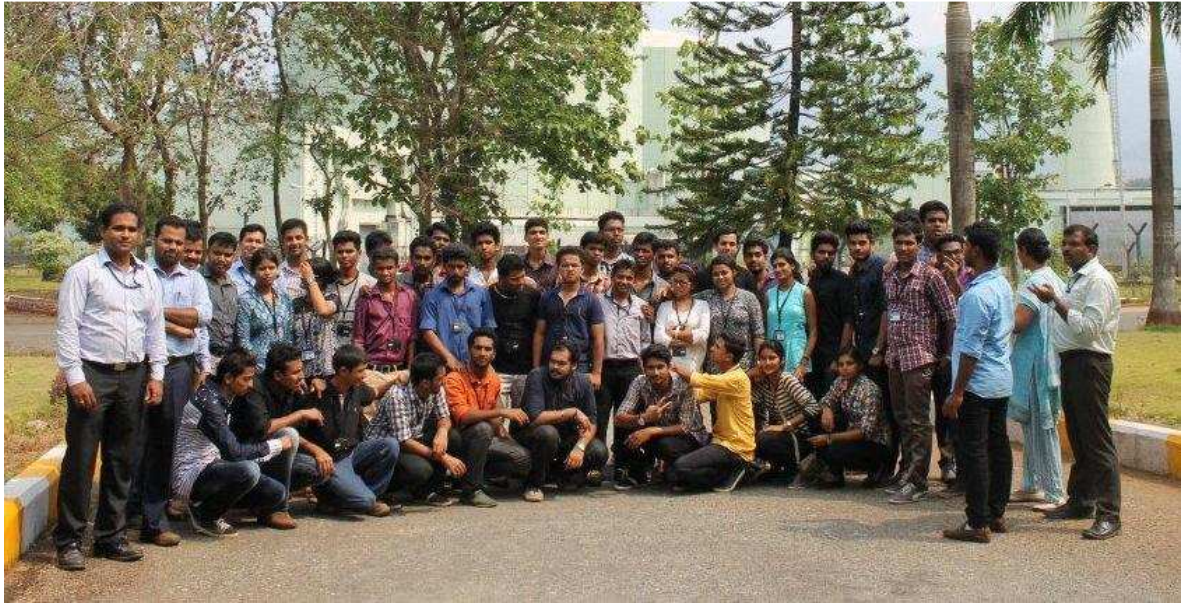
Srinivas Institute of Technology, Mangaluru