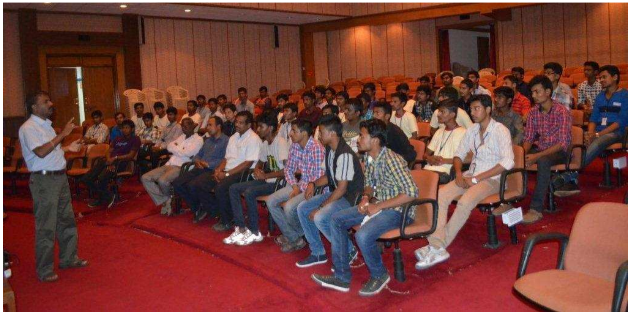
Sri Lakshmi Venkateshwara B.Ed College, Kudlgi, Bellary