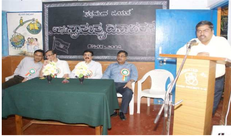
Chairman PAC addressing the students & staff members of virje Higher Primary School on the eve of Independence Day Celebration 2013