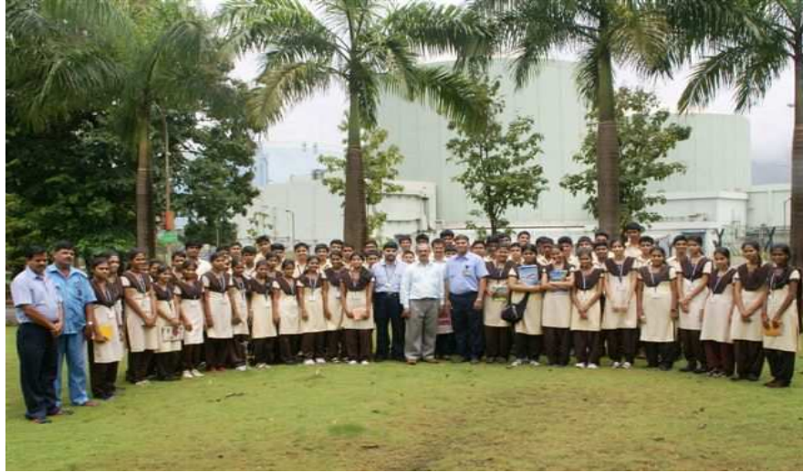
Visit of Smt.Chandrabhaga Tukoba Naik Higher Secondary School, Curchorem, Goa