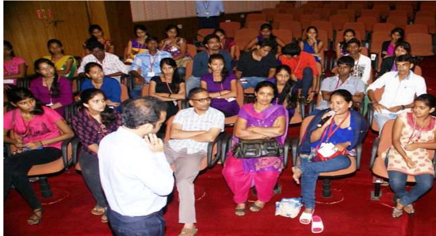
Visit of Students & Staff members- Shree Mallikarjun College of Arts & Commerce, Canacona, Goa