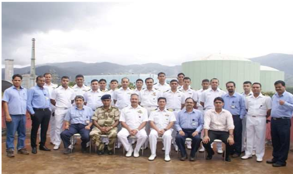
Visit of Indian Navy Officers, Naval Base, Karwar