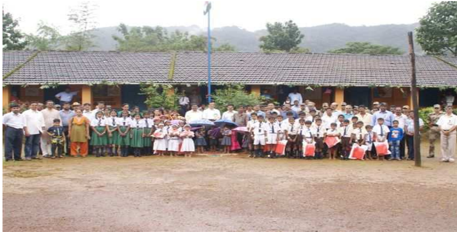
Distribution of Shoes & umbrella to the Scool Children on the occasion of Independence Day Celebration 2013