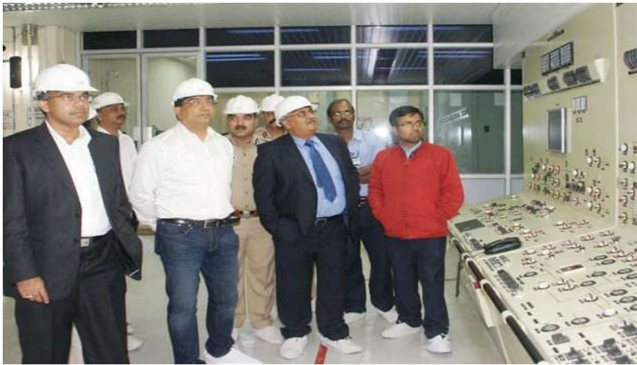
Visit of participants (VVIPs) of NDMA meeting held at Kaiga Town Ship