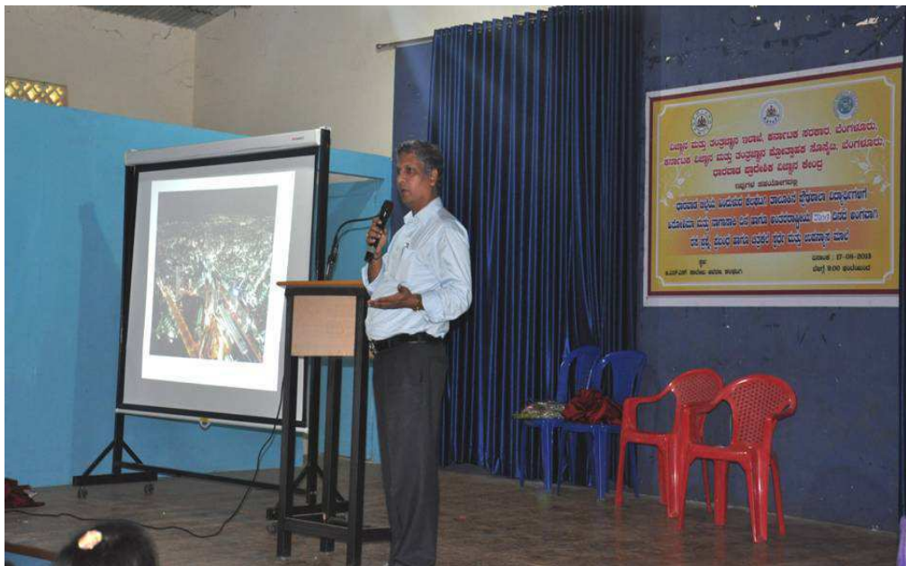
Presentation during the Programme at Kalghatgi