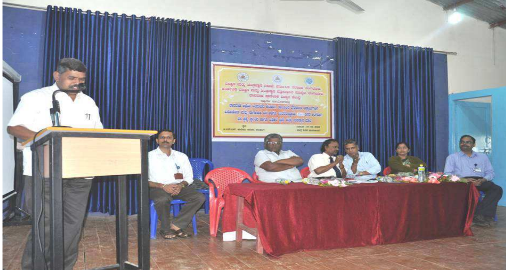
Public Awareness programme at Good News College, Kalghatgi