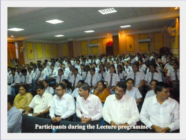
Participants during the Lecture programme