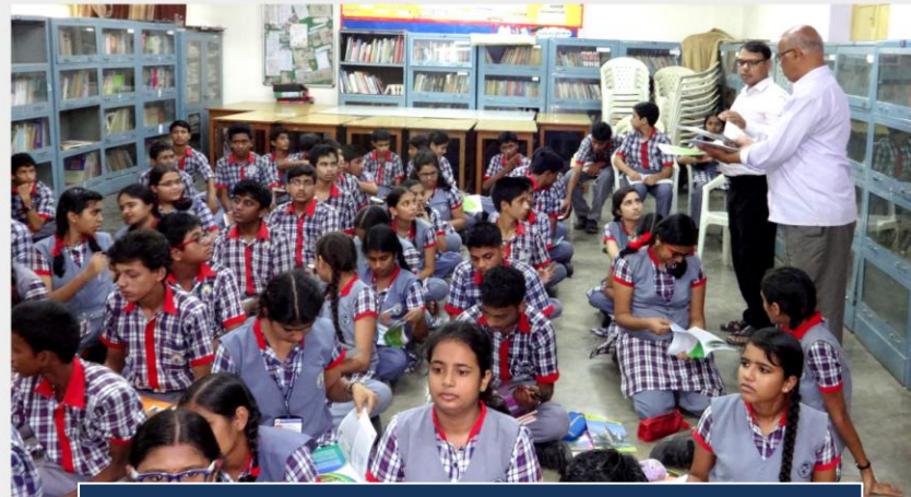
NPCIL publications being distributed to Students