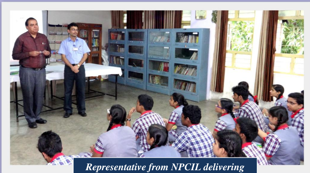
Representative from NPCIL delivering presentation to students of KV