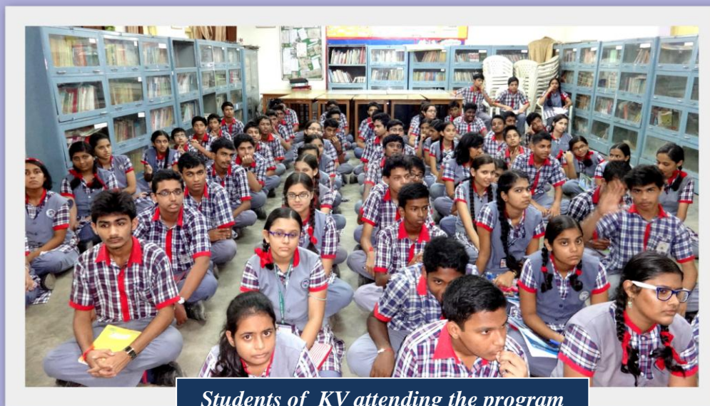
Students of KV attending the program