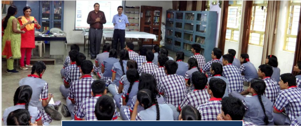
Students of KV attending the program