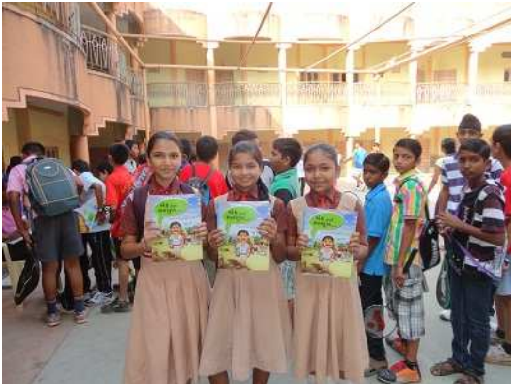
Cartoon Books on Nuclear Energy distributed to students of K M Gandhi School, Vyara during Khel Mahakumbh-2013 on 01/12/2013