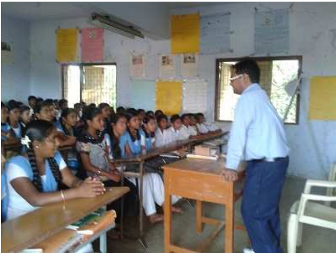
KAPS Official delivering PAP Lecture in Gyandeeep Vidyalaya, Unchamala, during Khel Mahakumbh-2013 on 02/12/2013