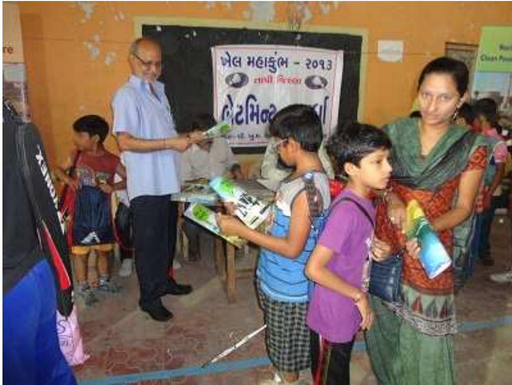
Cartoon Books on Nuclear Energy being distributed during Public Awareness Programme in K M Gandhi School, Vyara during Khel Mahakumbh-2013 on 01/12/2013