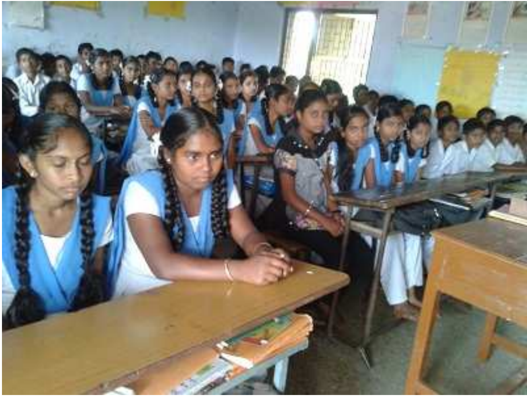
Public Awareness Programme in Gyandeeep Vidyalaya, Unchamala, during Khel Mahakumbh-2013 on 02/12/2013