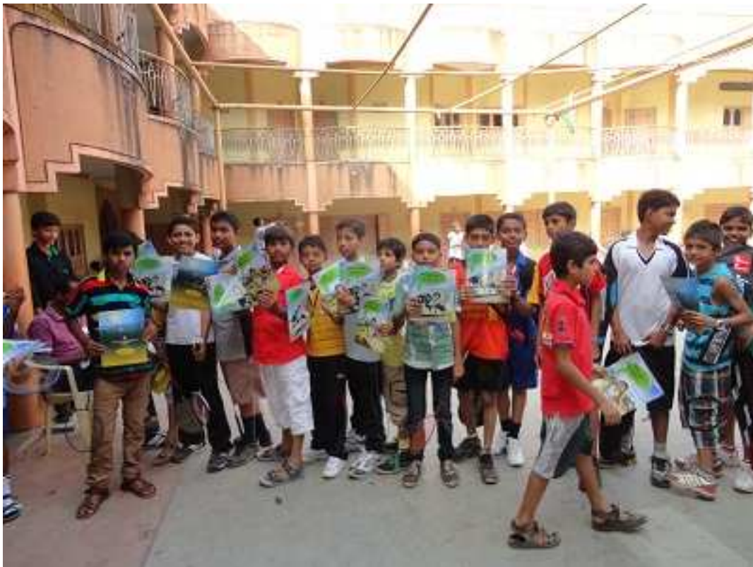
Cartoon Books on Nuclear Energy distributed to students of K M Gandhi School, Vyara during Khel Mahakumbh-2013 on 01/12/2013