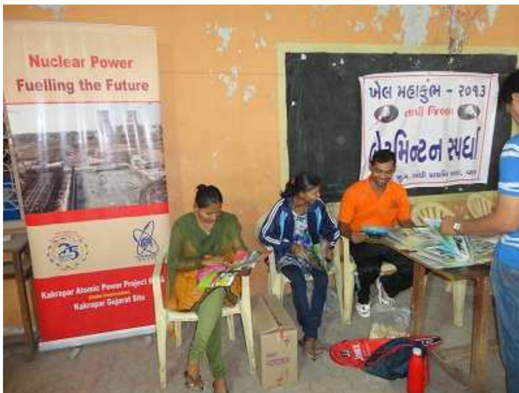
Teachers referring information booklets of KAPS during Public Awareness Programme in K M Gandhi School, Vyara during Khel Mahakumbh-2013 on 01/12/2013