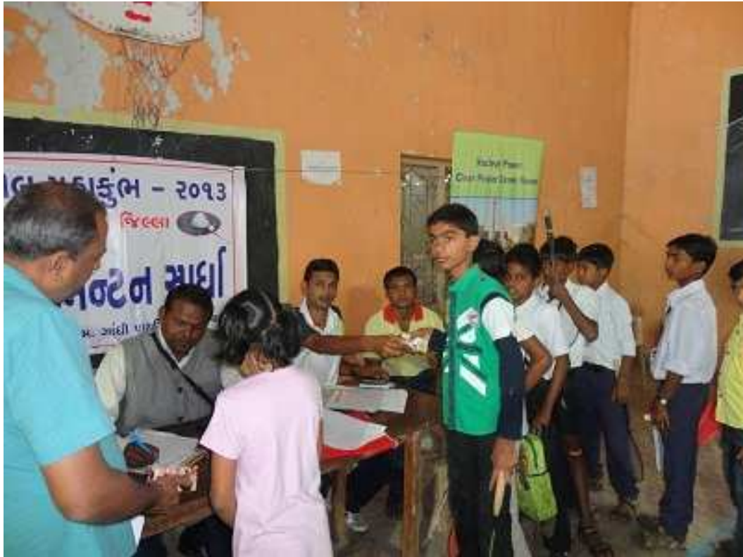
Registration and distribution of refreshments in Public Awareness Programme in K M Gandhi School, Vyara during Khel Mahakumbh-2013 on 01/12/2013