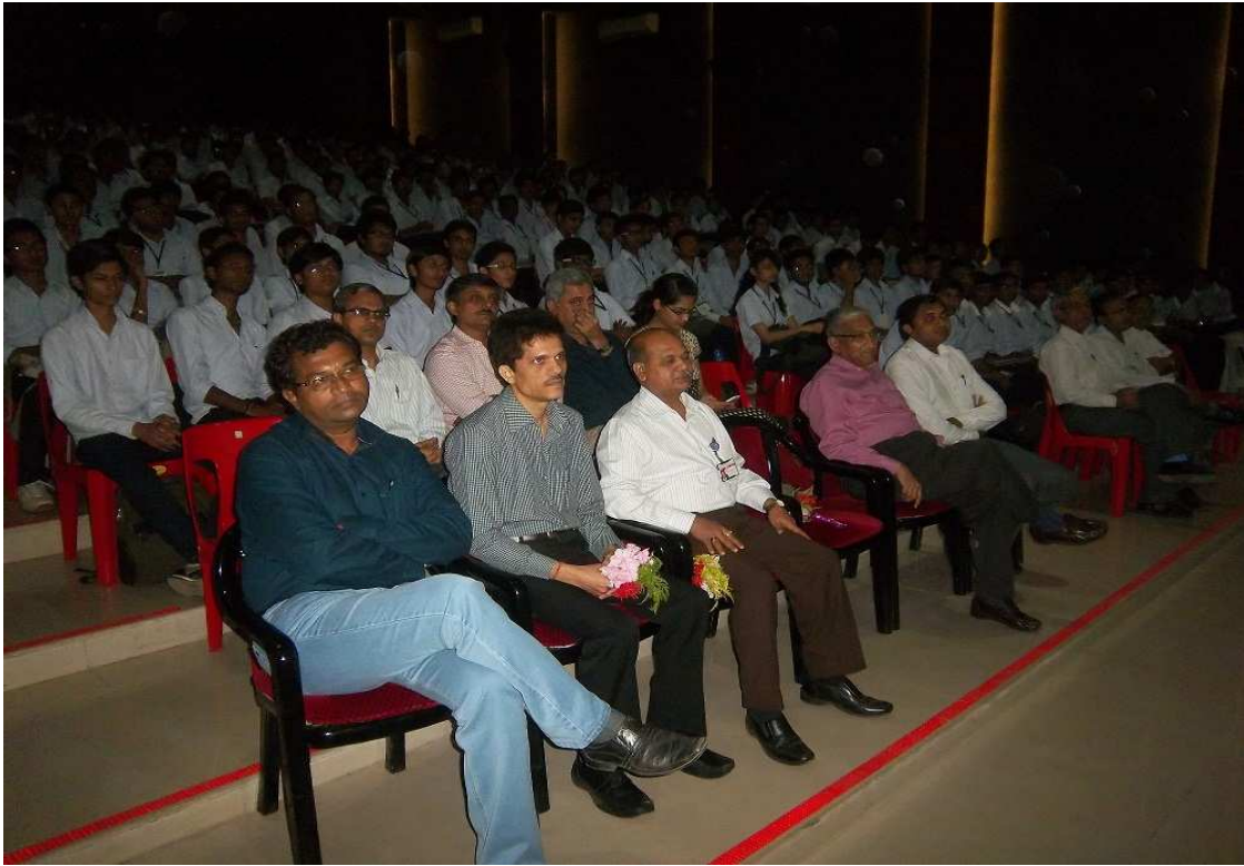
Seminar on "Nuclear Energy-An Inevitable Option" at C G Patel Institute of Technology, Bardoli (27/11/2013)