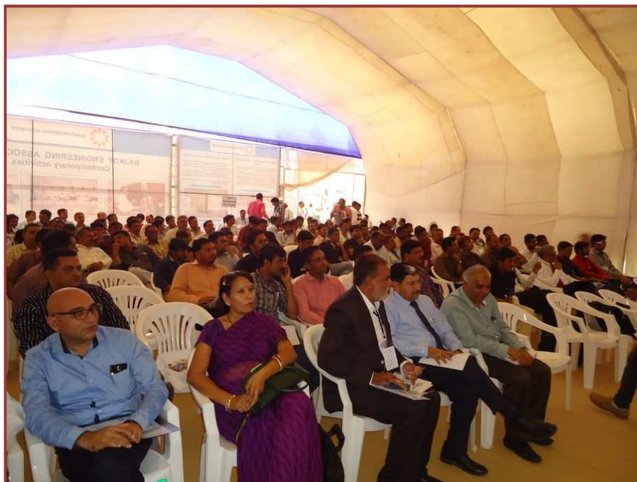
Vendors at seminar hall