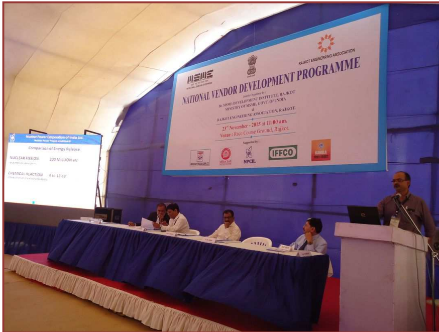
NCPIIL presentation in progress