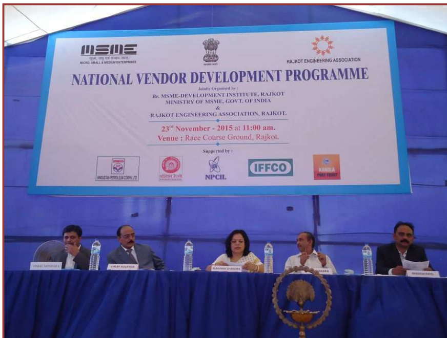
Inaugural Session in progress